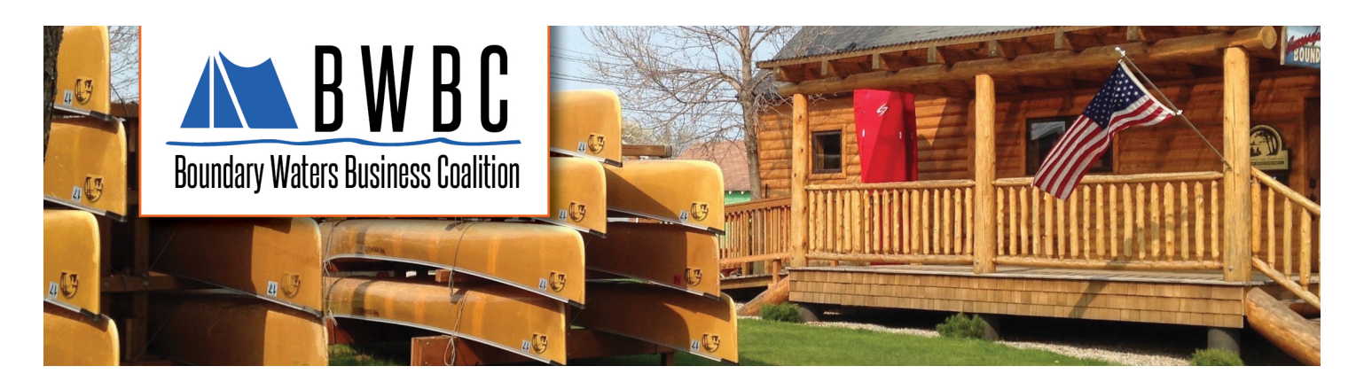
June 20, 2018